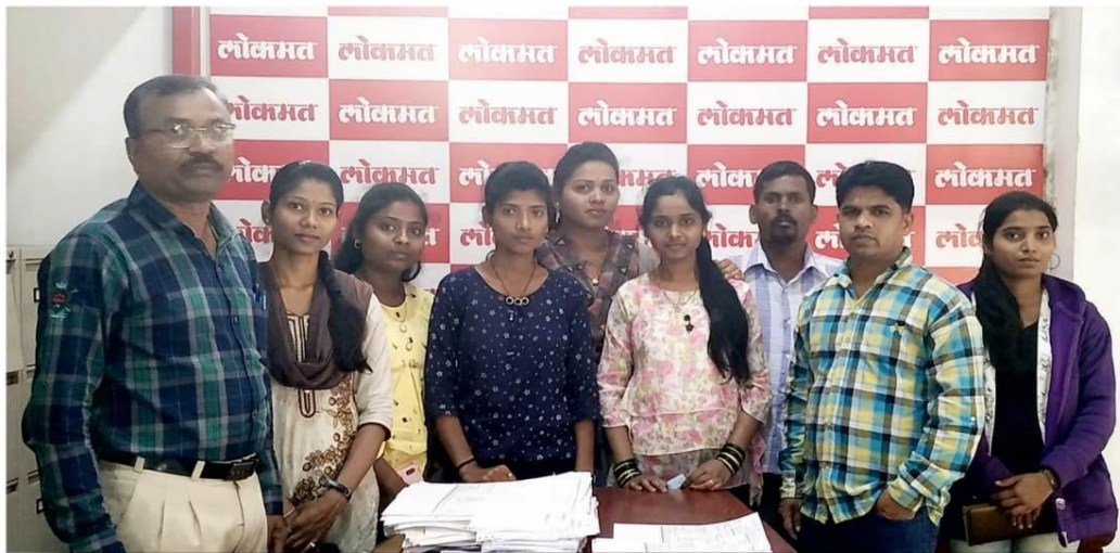
Study tour at daily Lokmat press, Kolhapur Date 17/12/2018